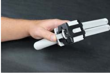
Lift Metal Tab